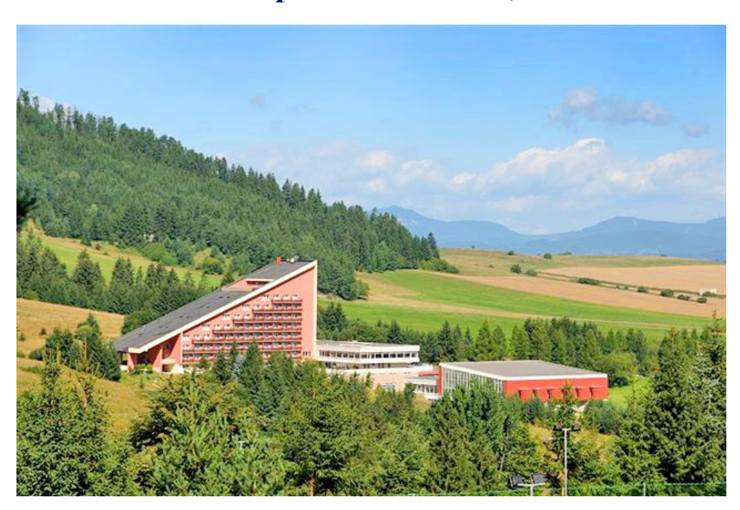
1. announcement, registration

Liptovský Ján (Hotel SOREA Máj) September 18. – 20, 2024